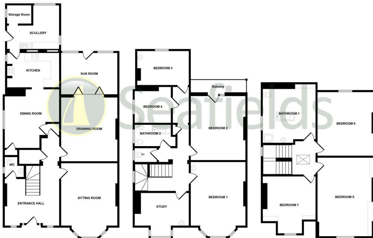
Ground Floor Approx 121 sq m / 1303 sq ft