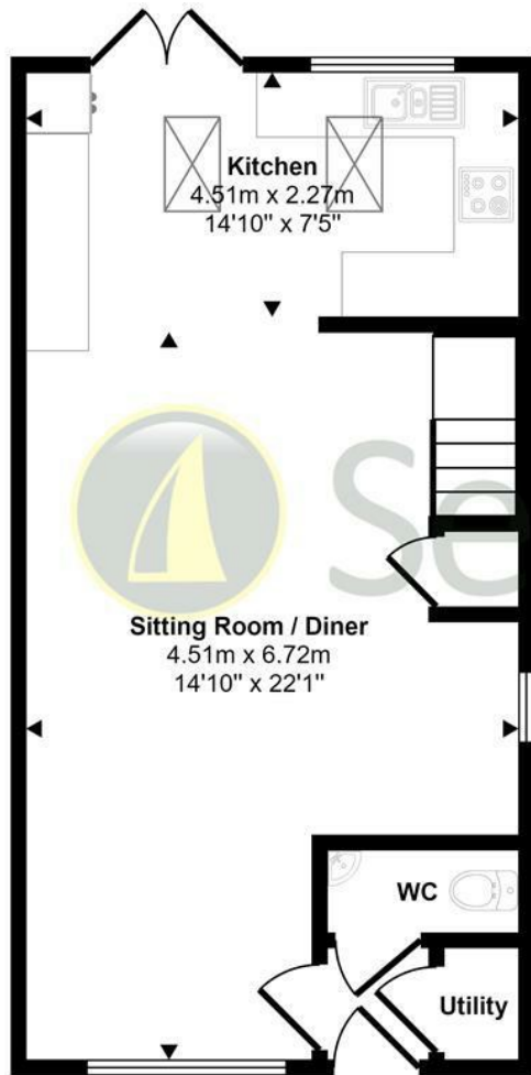
Ground Floor Approx 42 sq m / 447 sq ft

Approx Gross Internal Area 69 sq m / 739 sq ft